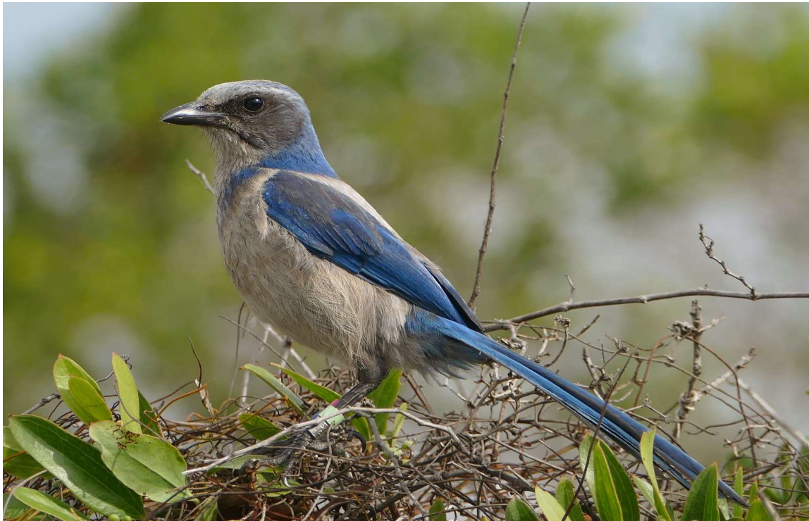
The endemic Florida Scrub-Jay

On this trip, participants will travel a swath of Florida from Gulf beaches to the Space Coast on the Atlantic Ocean, experiencing the wonders of winter birding in one of the country's top birding areas.