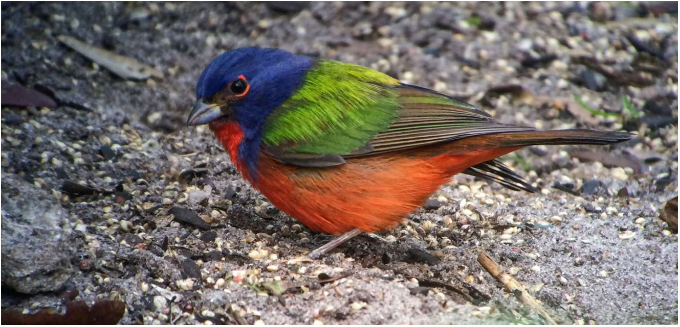
Painted Bunting