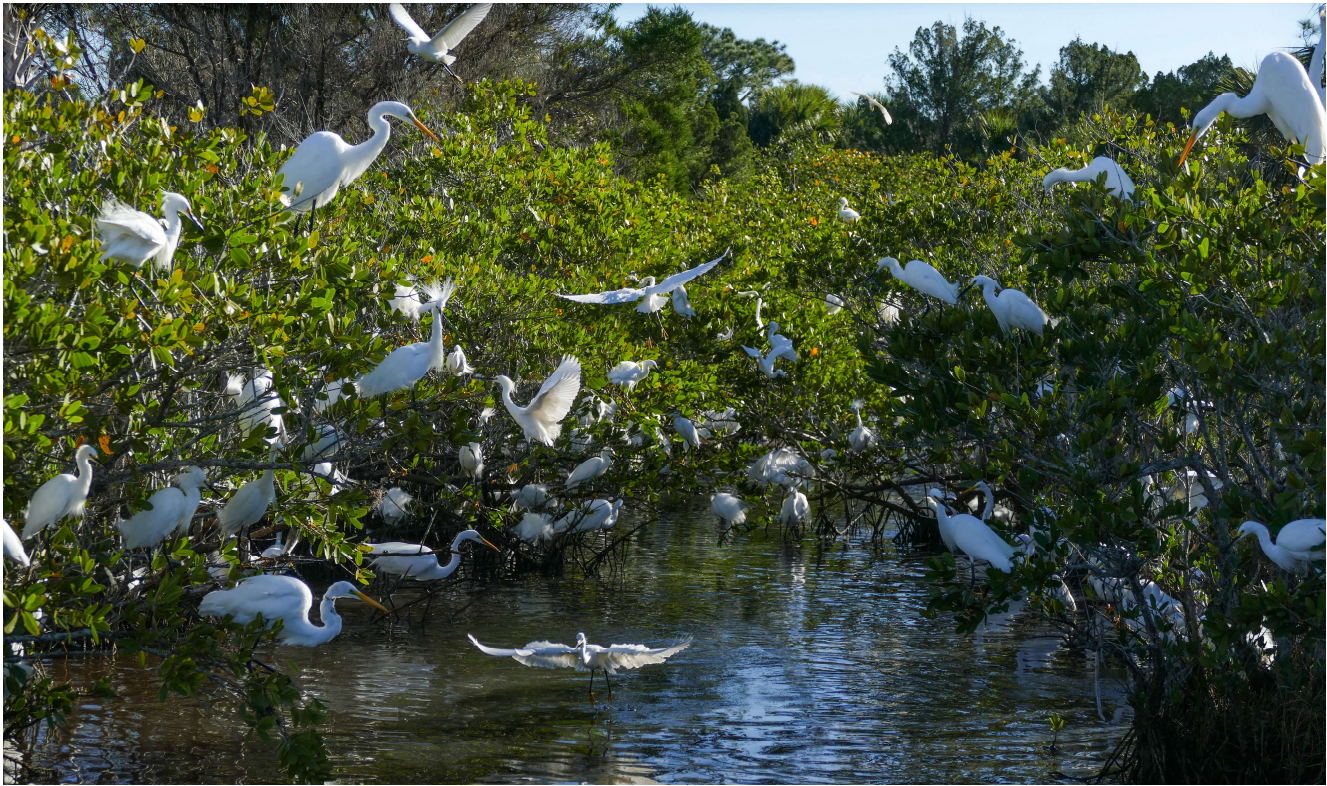
Feeding frenzy of egrets at Merritt Island