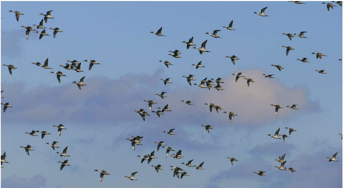
Northern Pintail over Merritt Island