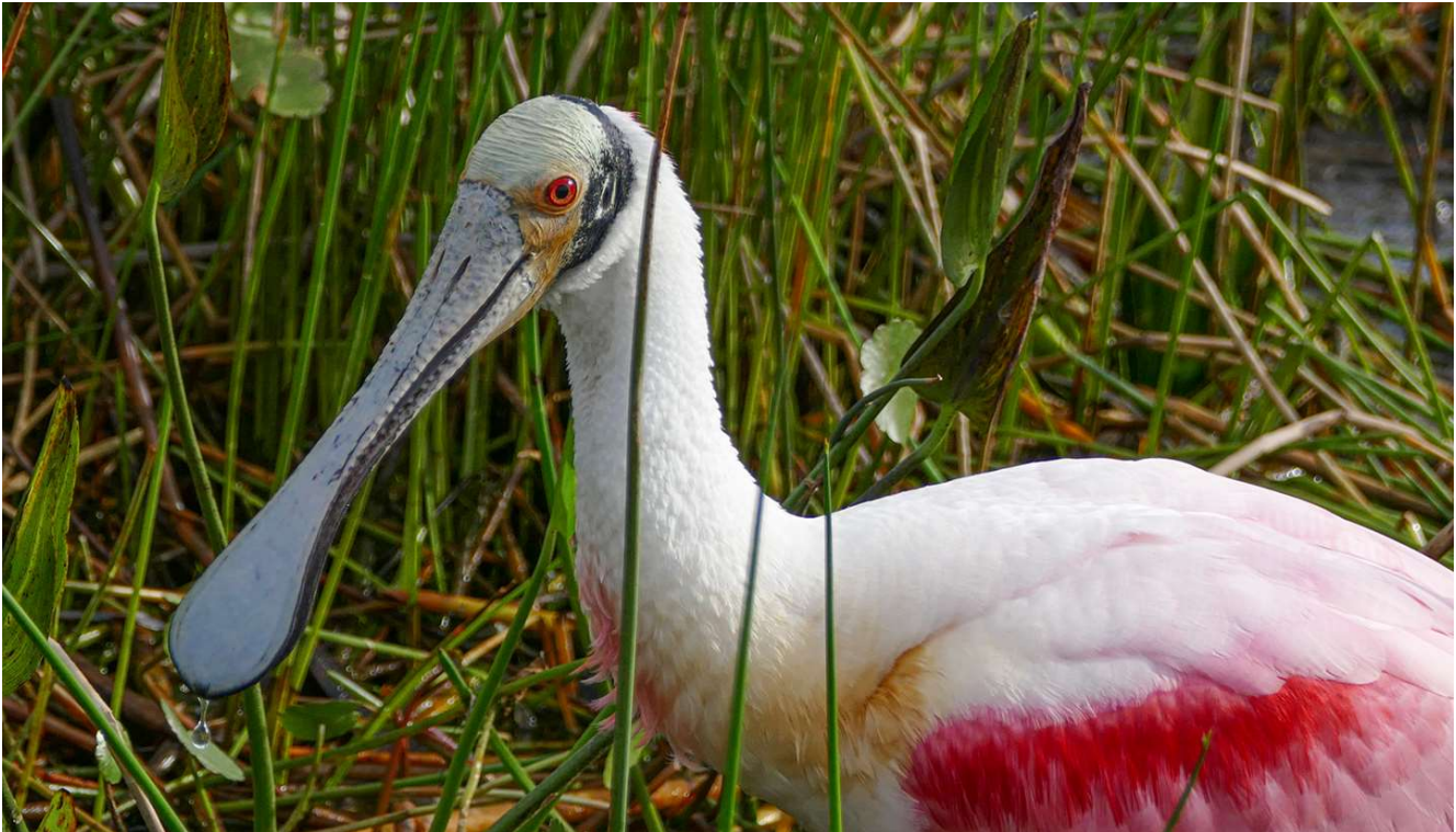
Roseate Spoonbill