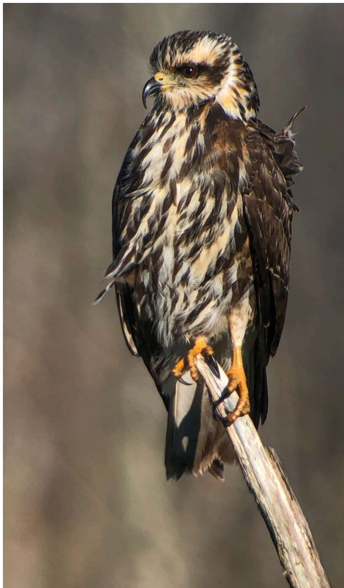
Snail Kite

February 6, Day 7: Wetlands and Pinelands for Florida Specialties. This day, we will visit several sites for some of the most emblematic bird species of the region. We will set out towards interior habitats such as the Orlando Wetlands Park in search of Limpkin and Snail Kite, two species that thrive when Pomacea “apple” snails are present.